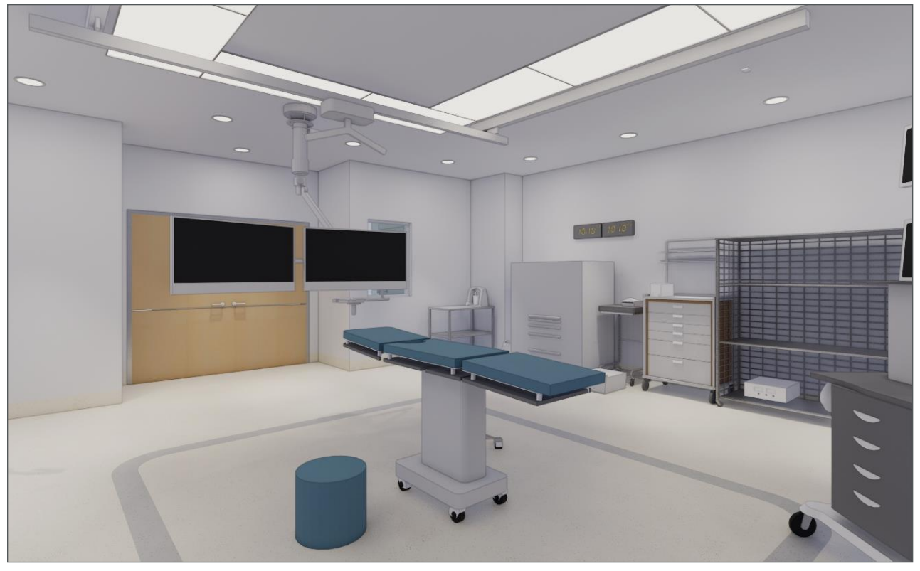
Artistic rendering of a typical operating room.