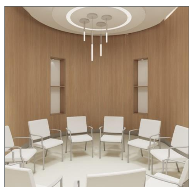
Artistic rendering of the Non-Denominational Spiritual Room.

Upon completion of construction, the design-builder is responsible for any testing and commissioning, after which the facility is turned over to the owner who is responsible for operations, maintenance and life cycle.