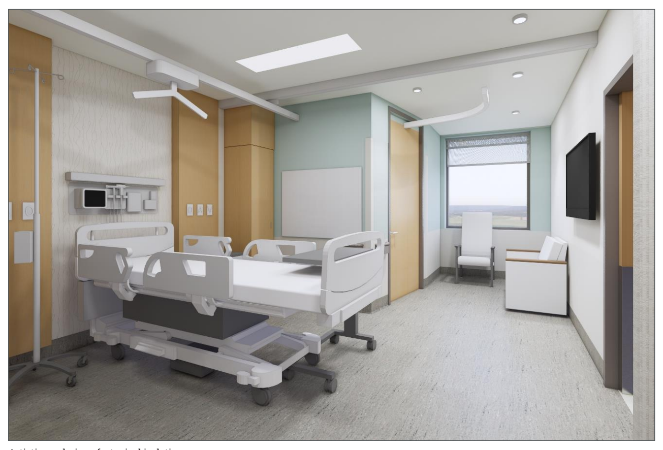
Artistic rendering of a typical isolation room.

Request for Qualifications (RFQ): The document issued by Northern Health as the first stage of the competitive selection process inviting interested parties to submit their qualifications to deliver the Project.