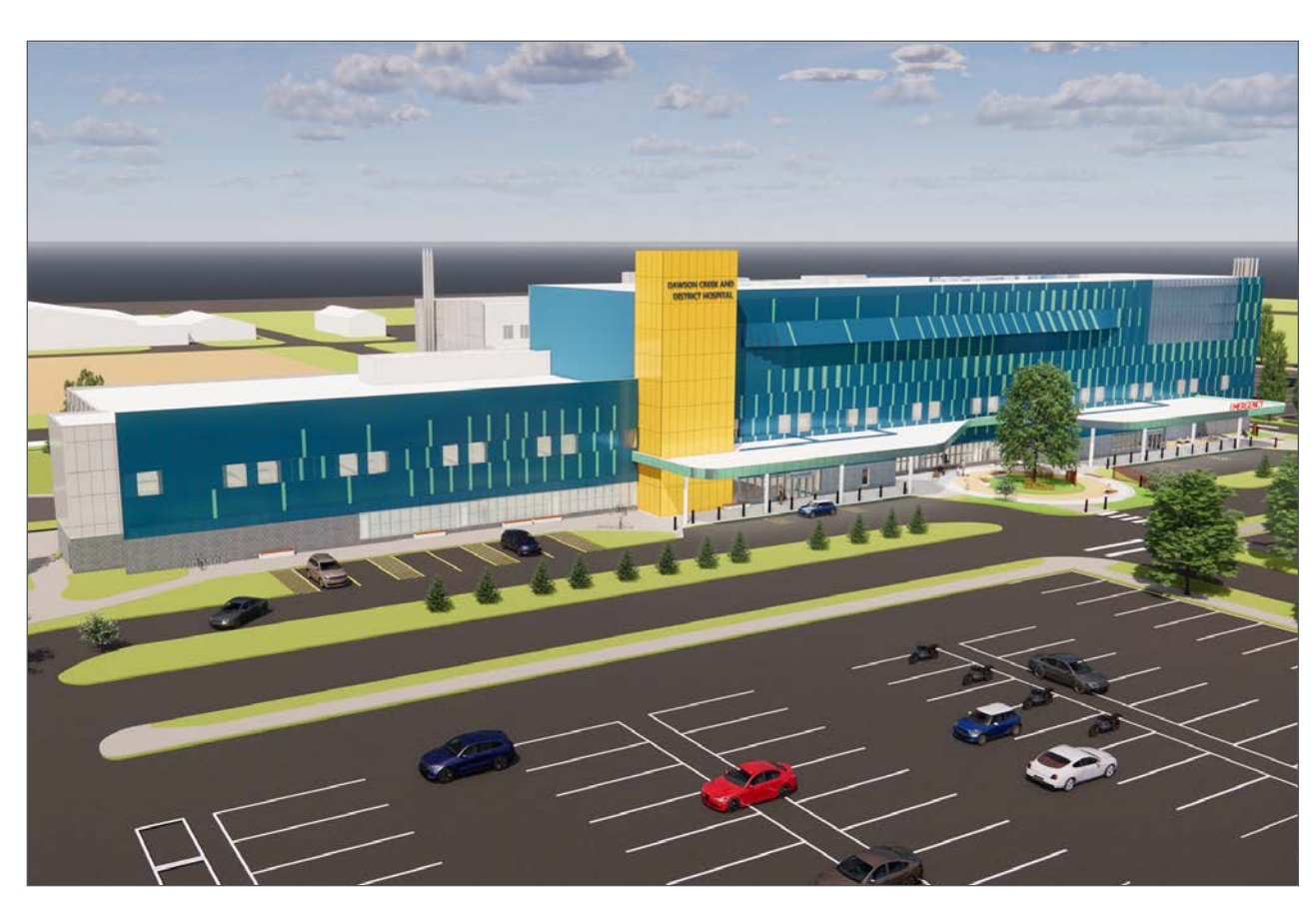
Artistic rendering of the hospital exterior.

Construction is scheduled to be completed in late 2026, with completion of the Project expected in 2027. Northern Health will retain ownership of the site, including all Project buildings and structures, and retain responsibility for all healthcare delivery.