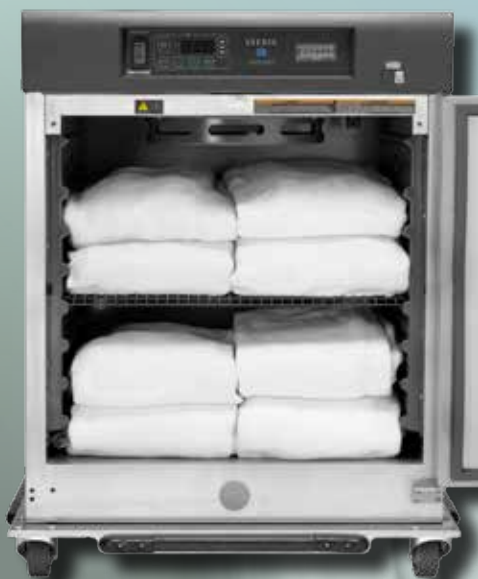
Adjustable blanket storage shelf, also included, can hold blankets or bottles