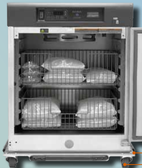
Two slide-out baskets for fluid storage are included with mid-size cabinet