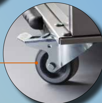
Sturdy locking casters for mobility and cleaning