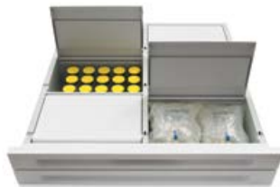
6-Bin Double-Deep Drawer