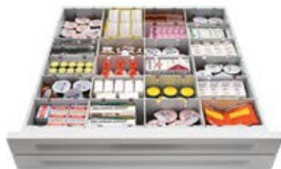
24-Bin Double-Deep Drawer