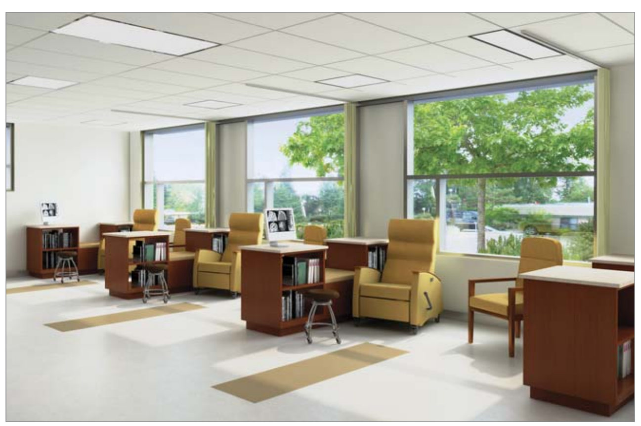
Artist's rendering of the systemic therapy (i.e. chemotherapy) unit. Large windows provide patients and staff with access to natural light and views of the outdoors, helping to create a healing environment.

For projects with certain attributes, the partnership delivery model can provide better value for taxpayers' dollars by efficiently allocating risk to the private sector and encouraging private sector innovation through rigorous competition. A partnership delivery model provides greater accountability for performance as ongoing payments made by the public sector are conditional on the private partner meeting the performance specifications as outlined in the project agreement.