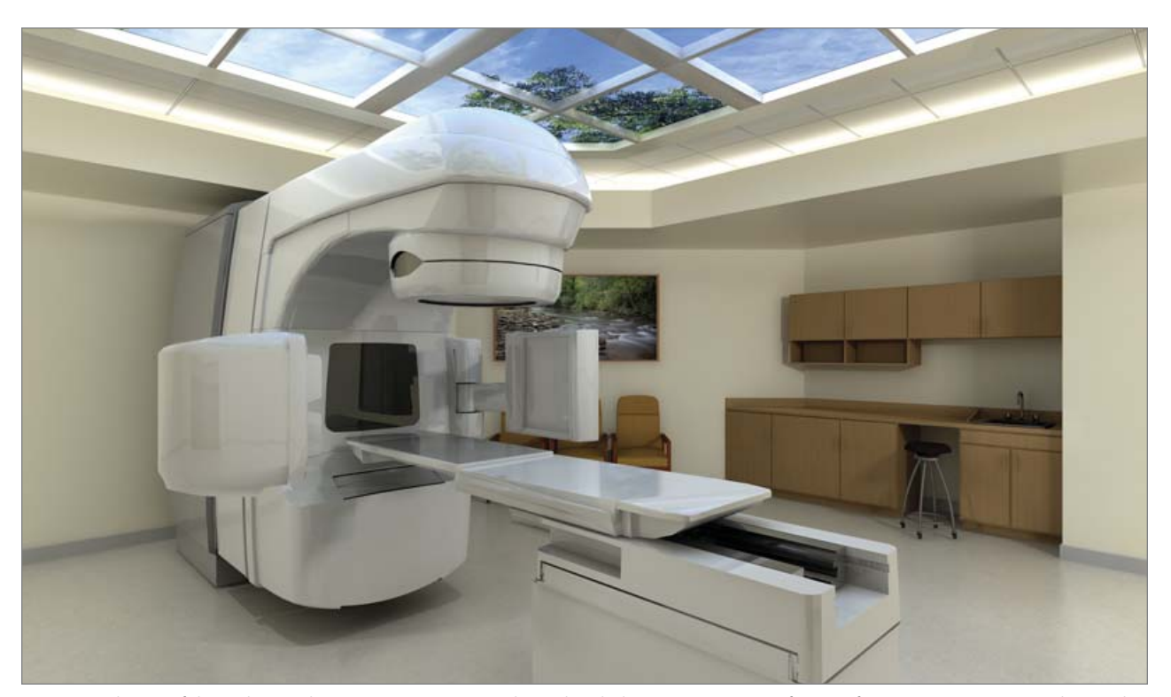
Artist's rendering of the radiation therapy unit. Images on the ceiling help convey a sense of peace for patients receiving radiation therapy.

The BC Cancer Agency and Partnerships BC analysed the net present cost (NPC) of the project's whole life costs and compared it to the NPC of the risk-adjusted, public sector comparator. Together, the BC Cancer Agency and Partnerships BC determined that the NPC of the Centre for the North, using a traditional delivery model, is an estimated $83.6 million. The final project agreement cost<sup>2</sup> for the Centre for the North has an NPC of $78.7 million. In financial terms, the final project agreement is estimated to achieve value for taxpayers' dollars of $4.9 million.