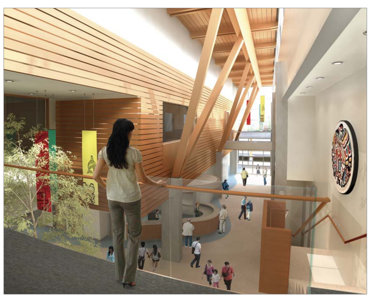
Artist's rendering of the interior atrium. Wood will be showcased in the exterior and interior of the Centre for the North, in recognition of the importance of wood as a key building material for the north.

As a centre of partnership procurement expertise, Partnerships BC has developed an extensive library of best practices. Partnerships BC continually transfers knowledge and experience gained from past projects to others, to improve efficiency and quality, and to streamline and expedite the procurement process to save time and money for both the public and private sectors. Partnerships BC's representation on project boards contributes to the application of best practices across projects and sectors. For example, the use of best practice procurement documents across health care projects, including the Centre for the North, has resulted in the reduction of certain procurement related costs.