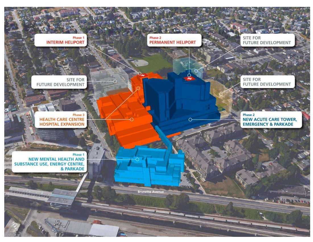
Figure 2 – RCH Project Phase Overview

Phase One is scheduled to reach substantial completion by December 2019 with patient occupancy anticipated in April 2020. The Authority does not expect to enter into the Project Design-Build Agreement prior to Phase One reaching substantial completion.