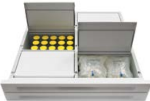
6-Bin Double-Deep Drawer