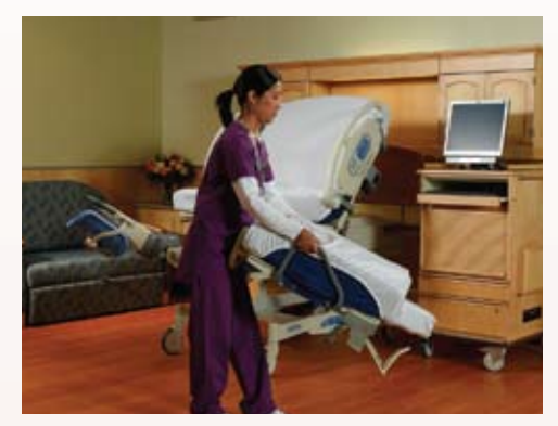
An optional lift-off foot section is available. Lightweight and easy to handle, the foot section stores on a built-in stand.