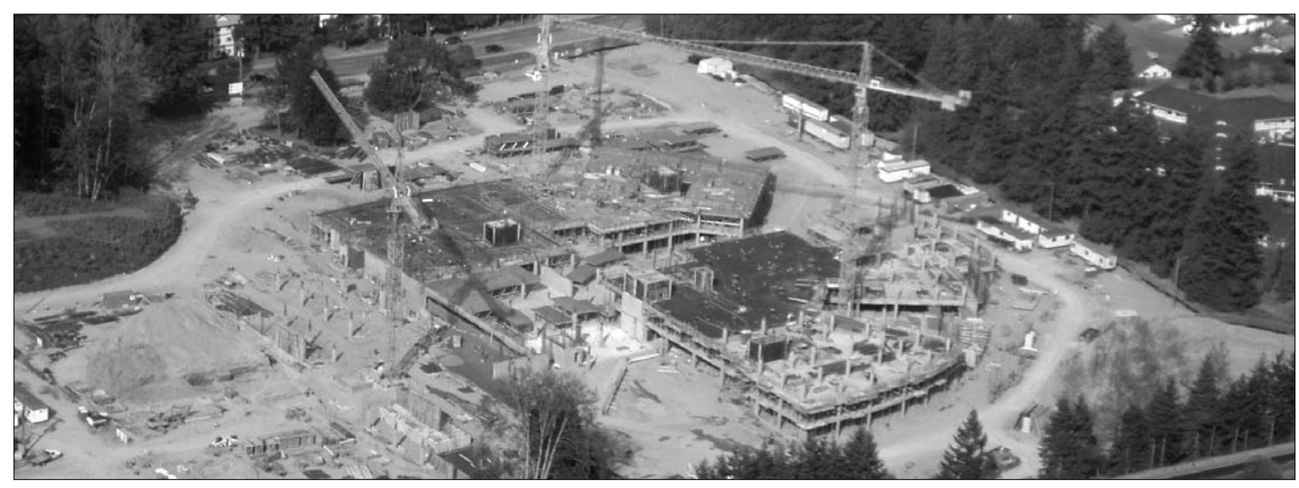
Abbotsford Regional Hospital and Cancer Centre