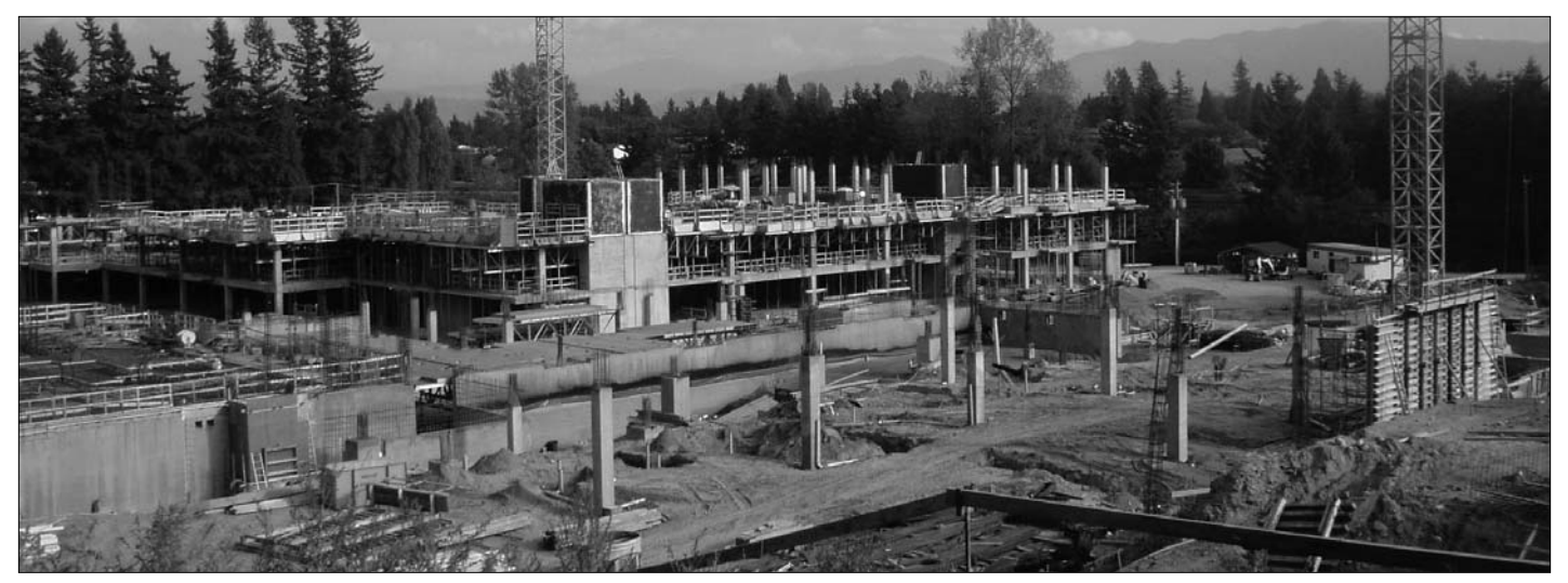
Abbotsford Regional Hospital and Cancer Centre