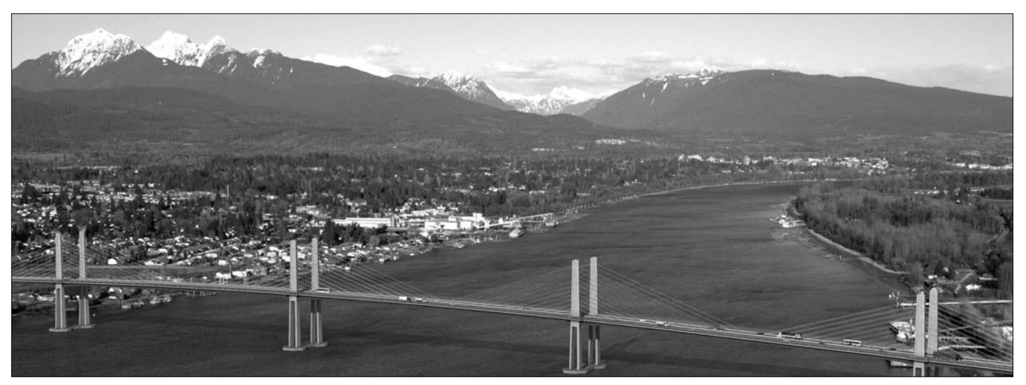
Golden Ears Bridge (artist's rendering)

The Government outlined five goals in the February 2005 Throne Speech, focusing on education and literacy, health and physical fitness, support for persons with disabilities, special needs, children at risk and seniors, sustainable environmental management, and job creation, detailed as follows: