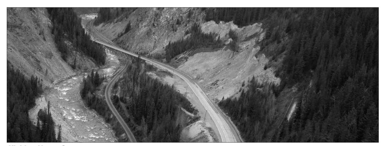
Kicking Horse Canyon

Partnerships British Columbia's 2005-06 fiscal year built upon the successes of previous fiscal years with four Partnerships British Columbia managed projects reaching financial close, and construction being completed on two projects and continuing on others. In addition, Partnerships British Columbia supported the Province in reaching an agreement on the Canada Line Project and provided advisory services to TransLink for the Golden Ears Bridge Project, two projects which also reached financial close in 2005-06. Partnerships British Columbia also entered into new engagements ranging from procurement management to advisory services. British Columbia continues to gain recognition in the national and global market place for its advancements in providing value for money in public infrastructure. Partnerships British Columbia continues to be recognized as a catalyst and a leader in developing innovative solutions to public sector infrastructure needs.