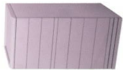
Pyxis® MedStation® 4000 system 6 or 7-drawer auxiliary 22.8" W x 27.6" D x 47" H