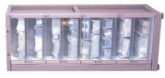
Pyxis® MedStation® 4000 system single column auxiliary (4 doors) 31" W x 28" D x 79.5" H