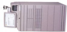
Pyxis® MedStation® 4000 system 6-drawer main 22.8" W x 27" D x 55" H