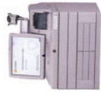
Pyxis® MedStation® 4000 system 2-drawer main 22.8" W x 27" D x 27.8" H