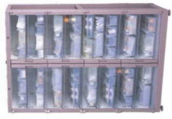
Pyxis® MedStation® 4000 system double column auxiliary (8 doors) 52" W x 28" D x 79.5" H