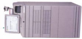
Pyxis® MedStation® 4000 system 4-drawer main plus bin 22.8" W x 27" D x 55" H