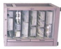
Pyxis® MedStation® 4000 system half-height column auxiliary (2 doors) 30" W x 28" D x 43" H