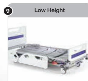
9 Low Height

The backrest will pause when raised to an angle of 30 degrees, ensuring easy and positive back-rest adjustment time after time.