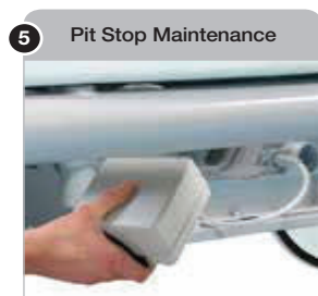
5 Pit Stop Maintenance

Designed for 'Pit Stop Maintenance' - open accessibility means changes such as actuator, control box and battery can be carried out in situ within a few minutes by one person.