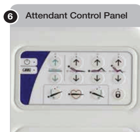
6 Attendant Control Panel

Designed for 'Pit Stop Maintenance' - open accessibility means changes such as actuator, control box and battery can be carried out in situ within a few minutes by one person.