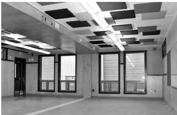
(Clockwise from top): Fort St. John Hospital and Residential Care Project; South Fraser Perimeter Road Project; Modular Classroom Project; Surrey Memorial Hospital Redevelopment and Expansion Project.