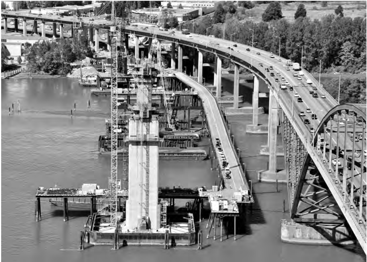
(Clockwise from top left): Royal Jubilee Hospital Patient Care Centre; Jim Pattison Outpatient Care and Surgery Centre; Vernon Jubilee Hospital's Polson Tower; Port Mann/Highway 1 Improvement Project (north tower construction).