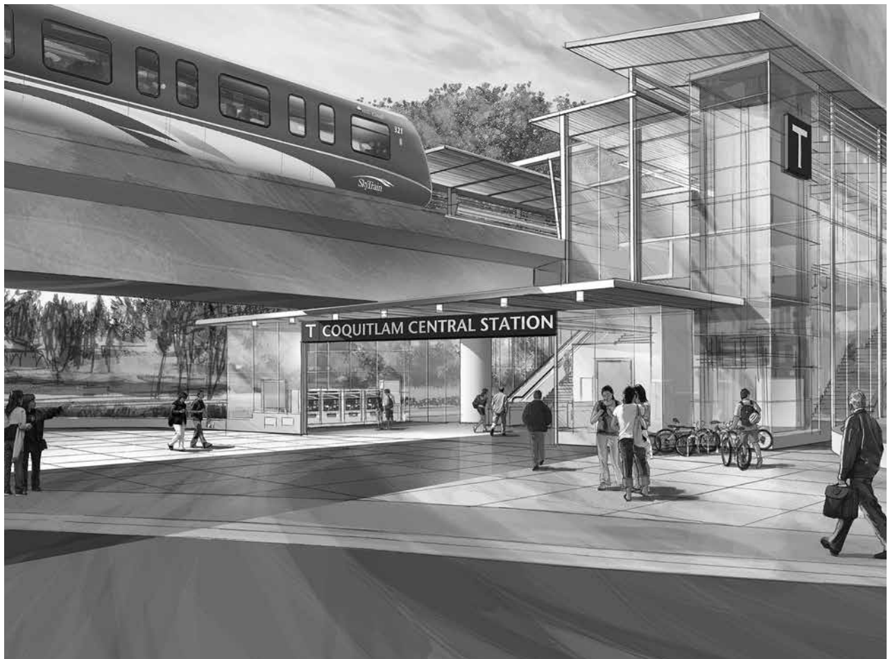
Artist rendering of the Evergreen Line Coquitlam station.

As the partnership program has matured and more projects have entered the construction and operations phase, Partnerships BC is well-positioned to provide support based on its knowledge of how project agreements are structured, and the allocation of roles and responsibilities between the public and private sector partners. There was concerted effort to review projects in the operations stage to gather real-time feedback and lessons to be applied to subsequent projects.