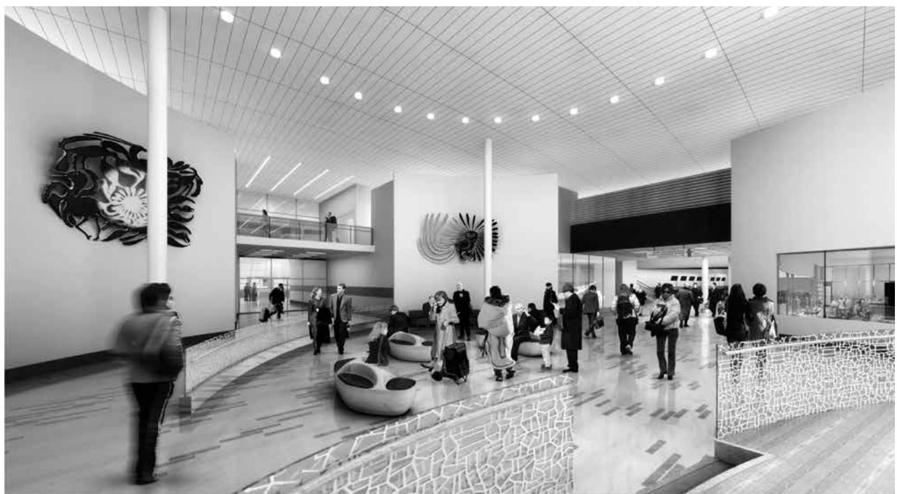
Artist rendering of the Nunavut Iqaluit International Airport exterior, airside (top) and interior terminal, landside.