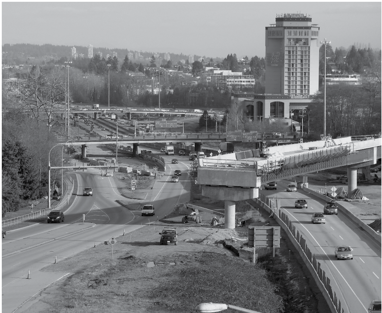
Port Mann Highway Improvement Project – Grandview Highway exit ramp

As the partnership program has matured and more projects have entered the construction and operations phase, Partnerships BC is well-positioned to provide support based on its knowledge of how project agreements are structured, and the allocation of roles and responsibilities between the public and private sector partners. There was concerted effort to review projects in the operations stage to gather real-time feedback and lessons to be applied to subsequent projects.