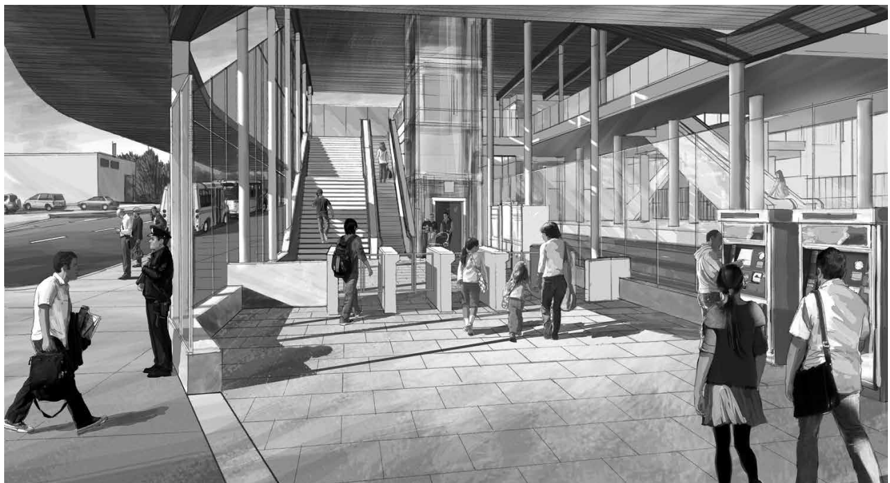
Artist rendering of Evergreen Line stations in Coquitlam (top) and Port Moody (bottom).